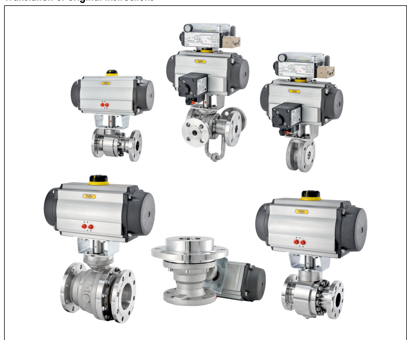
BR 26a / BR 26d / BR 26e / BR 26k / BR 26s Ball Valve BR 22a Bottom Drain Ball Valve