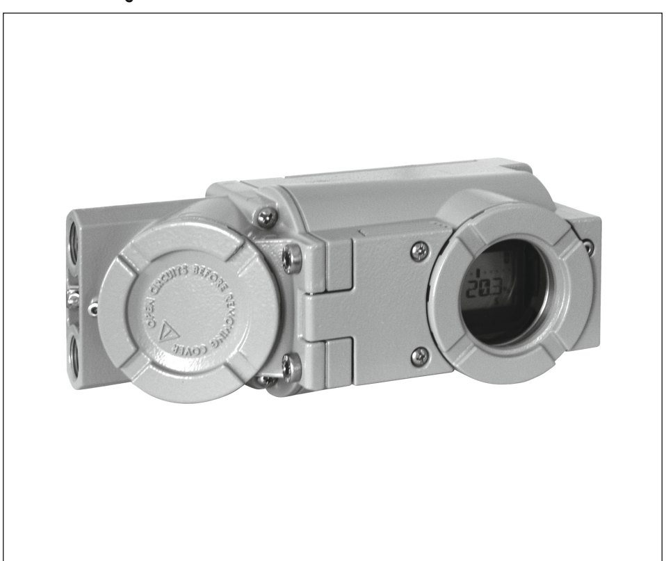
Type 3731-3 Electropneumatic Ex d Positioner